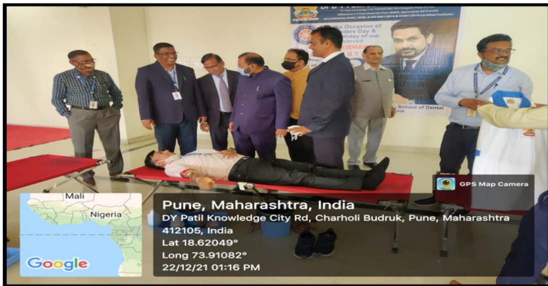
Blood Donation Camp dated 22-12-2021