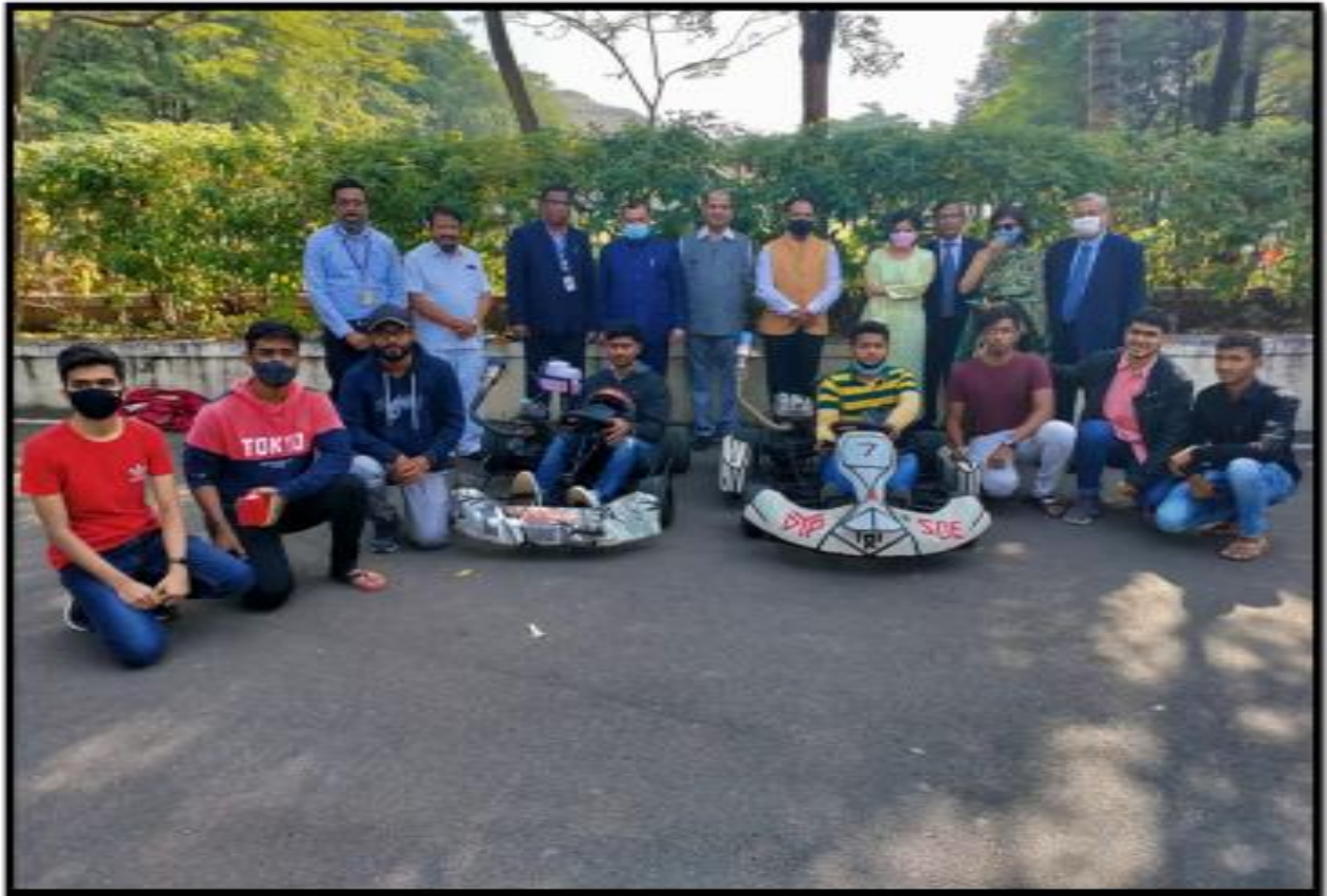
Unveiling of Go-kart dated 22-12-2021