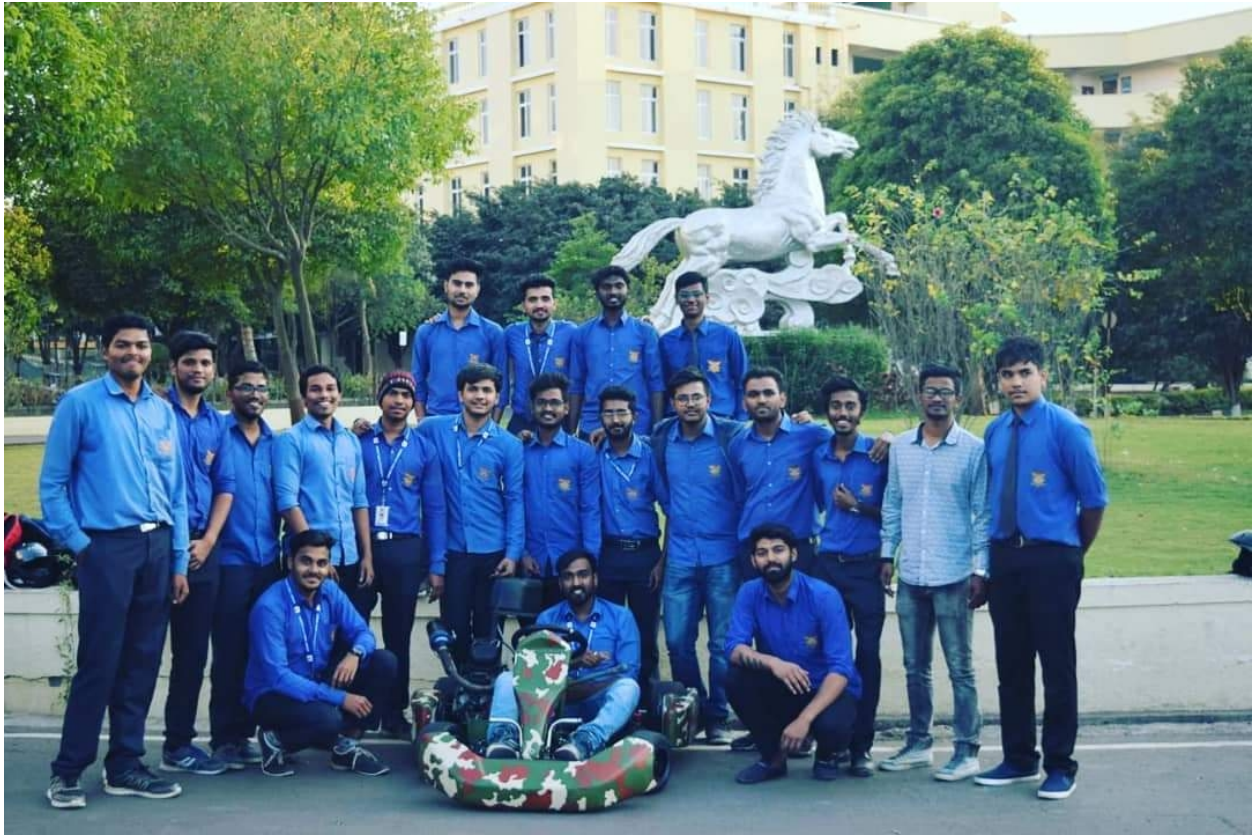
Go Kart Team, Winner of Skid pad Test held at LPU, Punjab