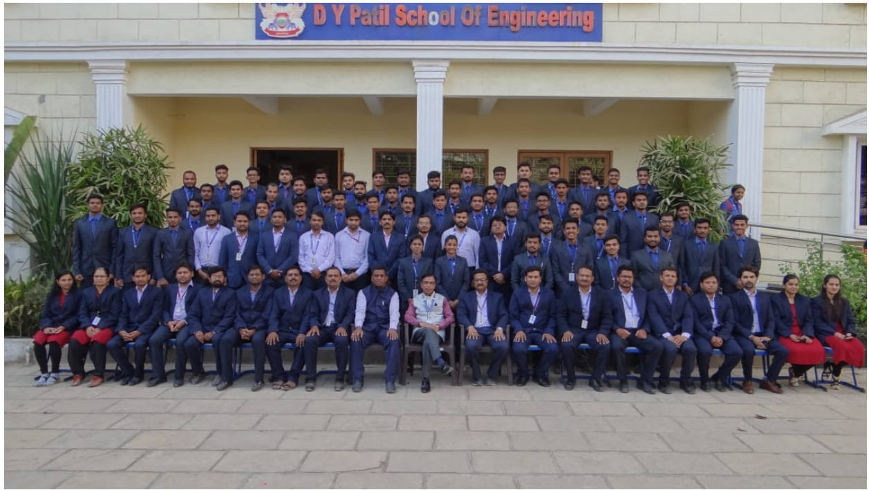
Group Photo of BE students with staff