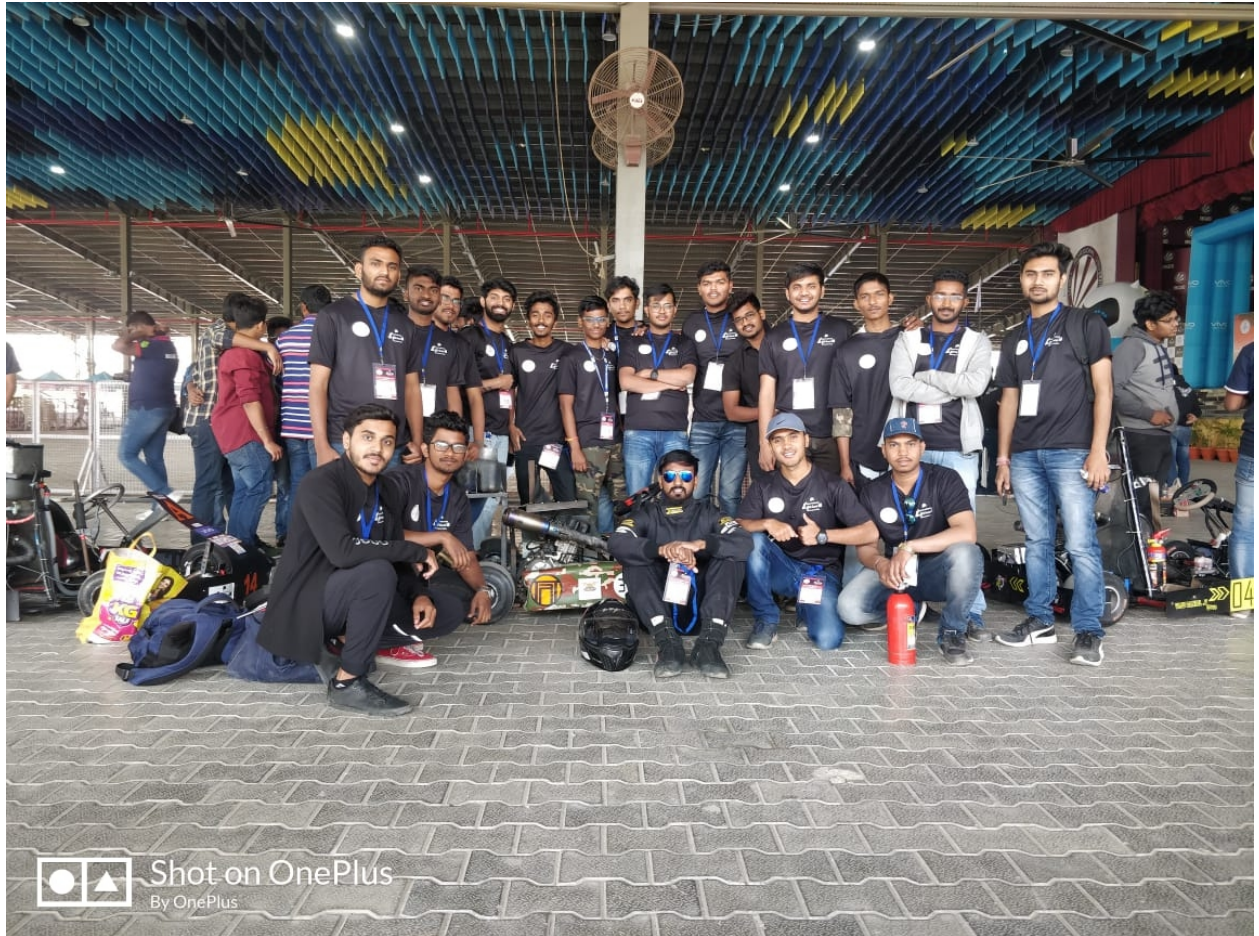
Go Kart Team, Winner of Skid pad Test held at LPU, Punjab