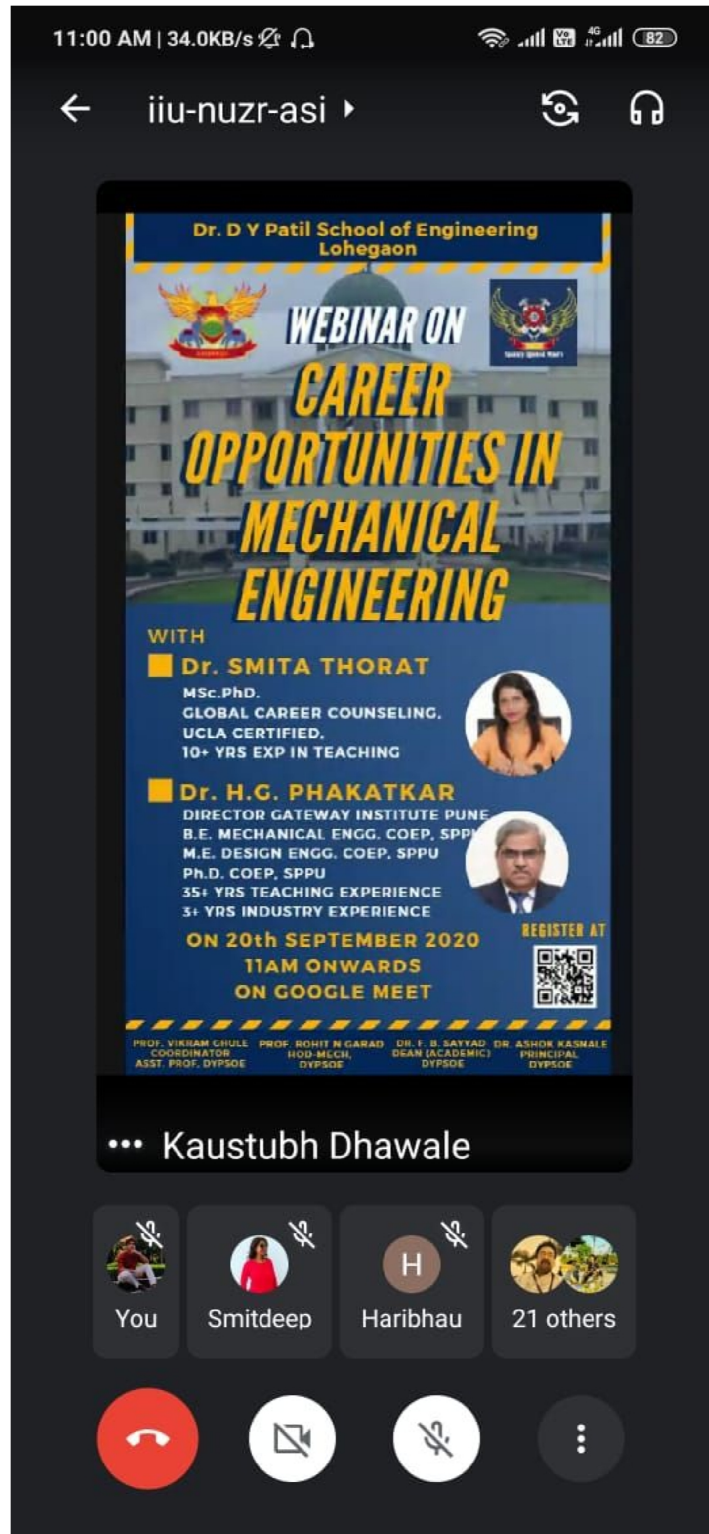
Webinar on 'Career opportunities in Mechanical Engineering'