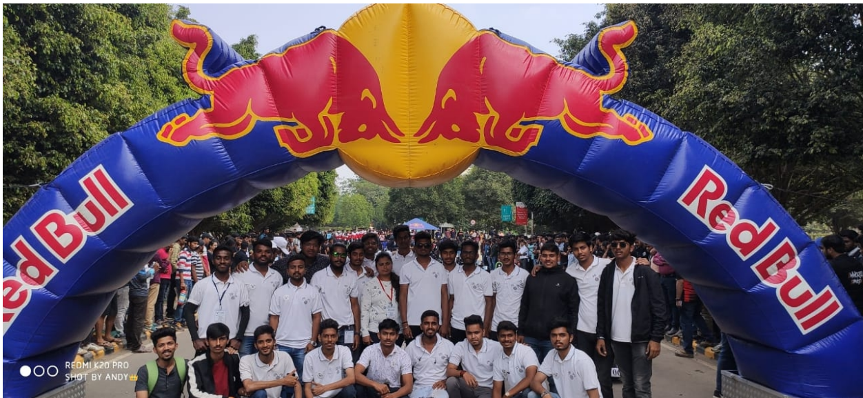
Auto India Racing Championship Season-4, Organized by Mechanical Engineering Department in Dr. D Y Patil School of Engg., Lohegaon campus