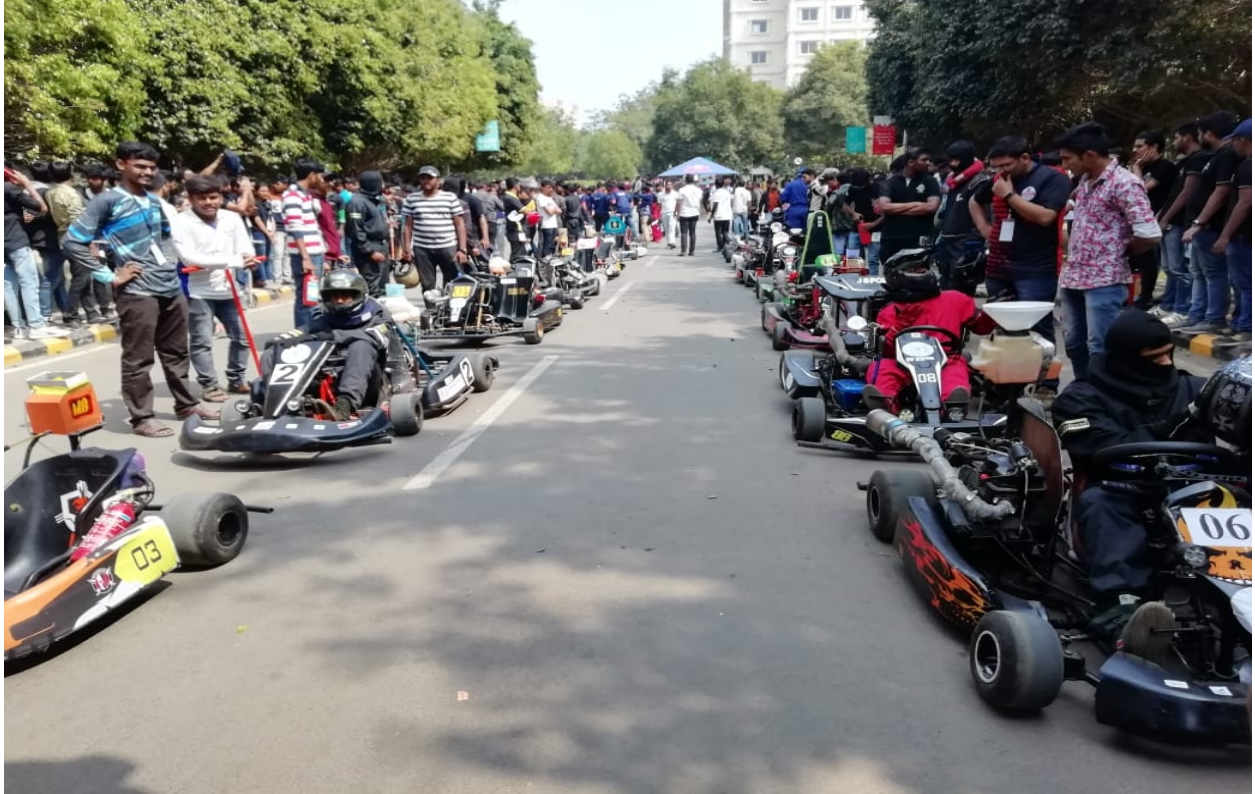
Auto India Racing Championship Season-4, Organized by Mechanical Engineering Department in Dr. D Y Patil School of Engg., Lohegaon campus