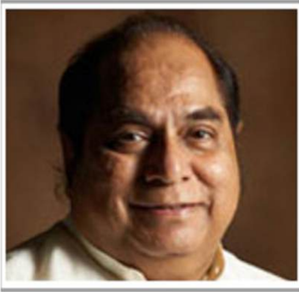
Dr. D Y Patil (Founder D Y Patil Group)

Dr D Y Patil, a Padmashree recipient, and former Governor of the Indian States of Bihar, Tripura and West Bengal is the founder of the D Y Patil Group. In the realm of Education and Healthcare in the state of Maharashtra, one name stands out like a shining beacon, that of Padmashree Dr D Y Patil. His vision, dedication and passion have been indelibly influenced, by his wisdom and generosity and have left several benchmarks, be it in the schools for imparting basic education or institutes for higher learning. He has materialized his dreams under the umbrella of prestigious education institutes in Kolhapur, Navi Mumbai and Pune. Padmashree Dr D Y Patil is the Governor of Bihar since 27th Nov 2009.