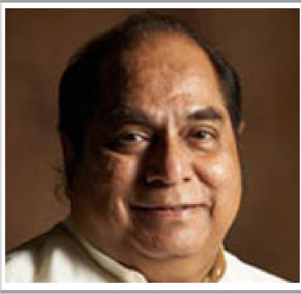
Dr. D Y Patil (Founder D Y Patil Group)

Dr D Y Patil, a Padmashree recipient, and former Governor of the Indian States of Bihar, Tripura and West Bengal is the founder of the D Y Patil Group. In the realm of Education and Healthcare in the state of Maharashtra, one name stands out like a shining beacon, that of Padmashree Dr D Y Patil. His vision, dedication and passion have been indelibly influenced, by his wisdom and generosity and have left several benchmarks, be it in the schools for imparting basic education or institutes for higher learning. He has materialized his dreams under the umbrella of prestigious education institutes in Kolhapur, Navi Mumbai and Pune. Padmashree Dr D Y Patil is the Governor of Bihar since 27th Nov 2009.