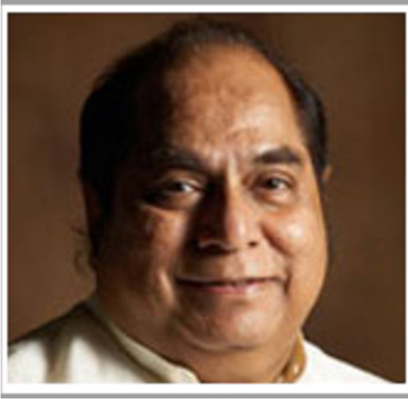
Dr. D Y Patil (Founder D Y Patil Group)

Dr D Y Patil, a Padmashree recipient, and former Governor of the Indian States of Bihar, Tripura and West Bengal is the founder of the D Y Patil Group. In the realm of Education and Healthcare in the state of Maharashtra, one name stands out like a shining beacon, that of Padmashree Dr D Y Patil. His vision, dedication and passion have been indelibly influenced, by his wisdom and generosity and have left several benchmarks, be it in the schools for imparting basic education or institutes for higher learning. He has materialized his dreams under the umbrella of prestigious education institutes in Kolhapur, Navi Mumbai and Pune. Padmashree Dr D Y Patil is the Governor of Bihar since 27th Nov 2009.