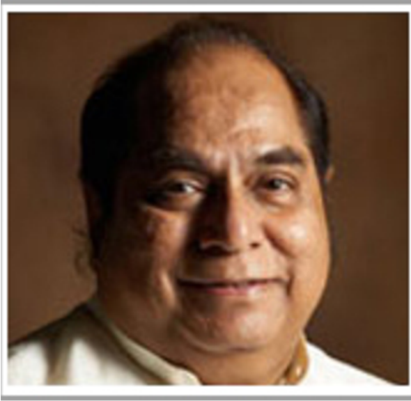
Dr. D Y Patil (Founder D Y Patil Group)

Dr D Y Patil, a Padmashree recipient, and former Governor of the Indian States of Bihar, Tripura and West Bengal is the founder of the D Y Patil Group. In the realm of Education and Healthcare in the state of Maharashtra, one name stands out like a shining beacon, that of Padmashree Dr D Y Patil. His vision, dedication and passion have been indelibly influenced, by his wisdom and generosity and have left several benchmarks, be it in the schools for imparting basic education or institutes for higher learning. He has materialized his dreams under the umbrella of prestigious education institutes in Kolhapur, Navi Mumbai and Pune. Padmashree Dr D Y Patil is the Governor of Bihar since 27th Nov 2009.