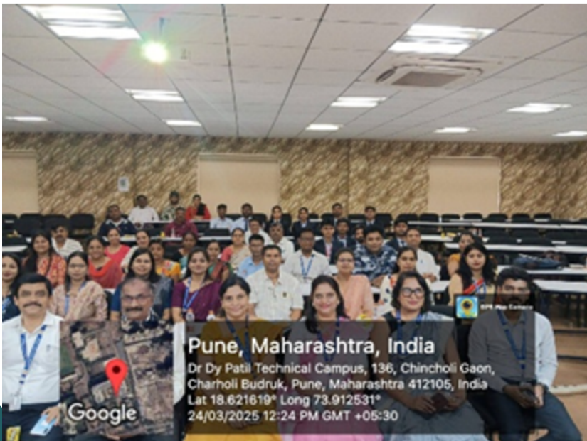
Parent-Teacher Meeting (PTM)