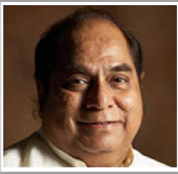
Dr. D Y Patil (Founder D Y Patil Group)

Dr D Y Patil, a Padmashree recipient, and former Governor of the Indian States of Bihar, Tripura and West Bengal is the founder of the D Y Patil Group. In the realm of Education and Healthcare in the state of Maharashtra, one name stands out like a shining beacon, that of Padmashree Dr D Y Patil. His vision, dedication and passion have been indelibly influenced, by his wisdom and generosity and have left several benchmarks, be it in the schools for imparting basic education or institutes for higher learning. He has materialized his dreams under the umbrella of prestigious education institutes in Kolhapur, Navi Mumbai and Pune. Padmashree Dr D Y Patil is the Governor of Bihar since 27th Nov 2009.