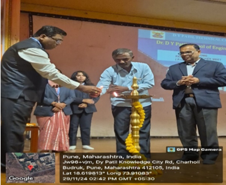
: Parent Teacher Meet-I (PTM-I)