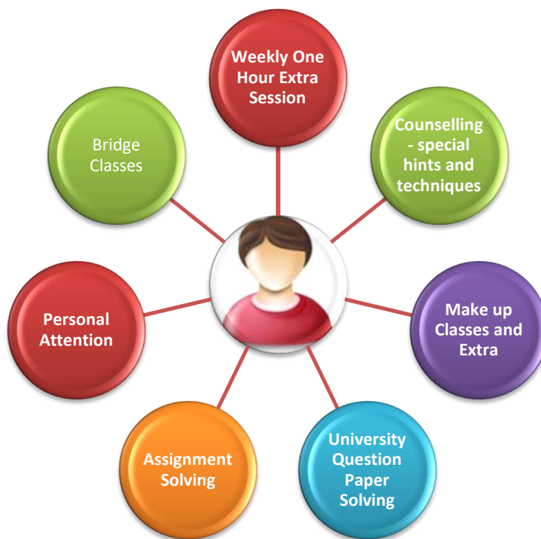
Fig. 2 Proposed activities for Slow Learner