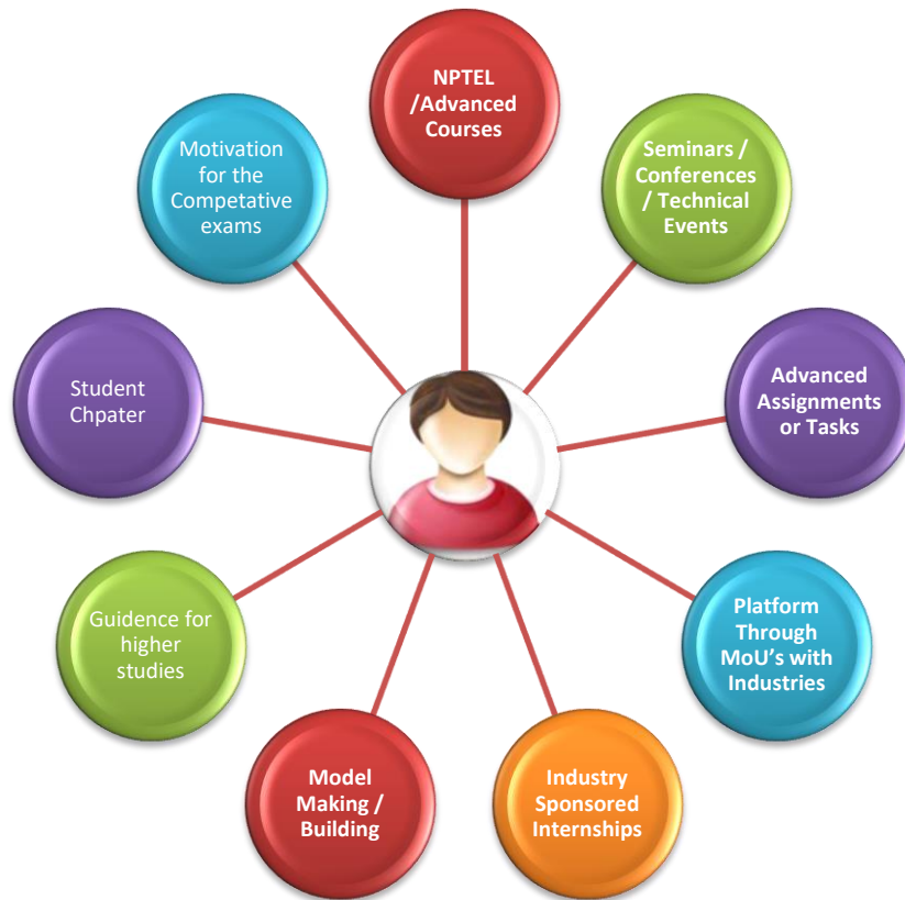
Fig. 3 Activities Conducted for Transitional & Advanced Learner

The subject teacher is responsible for implementing the complete process as per the manual.